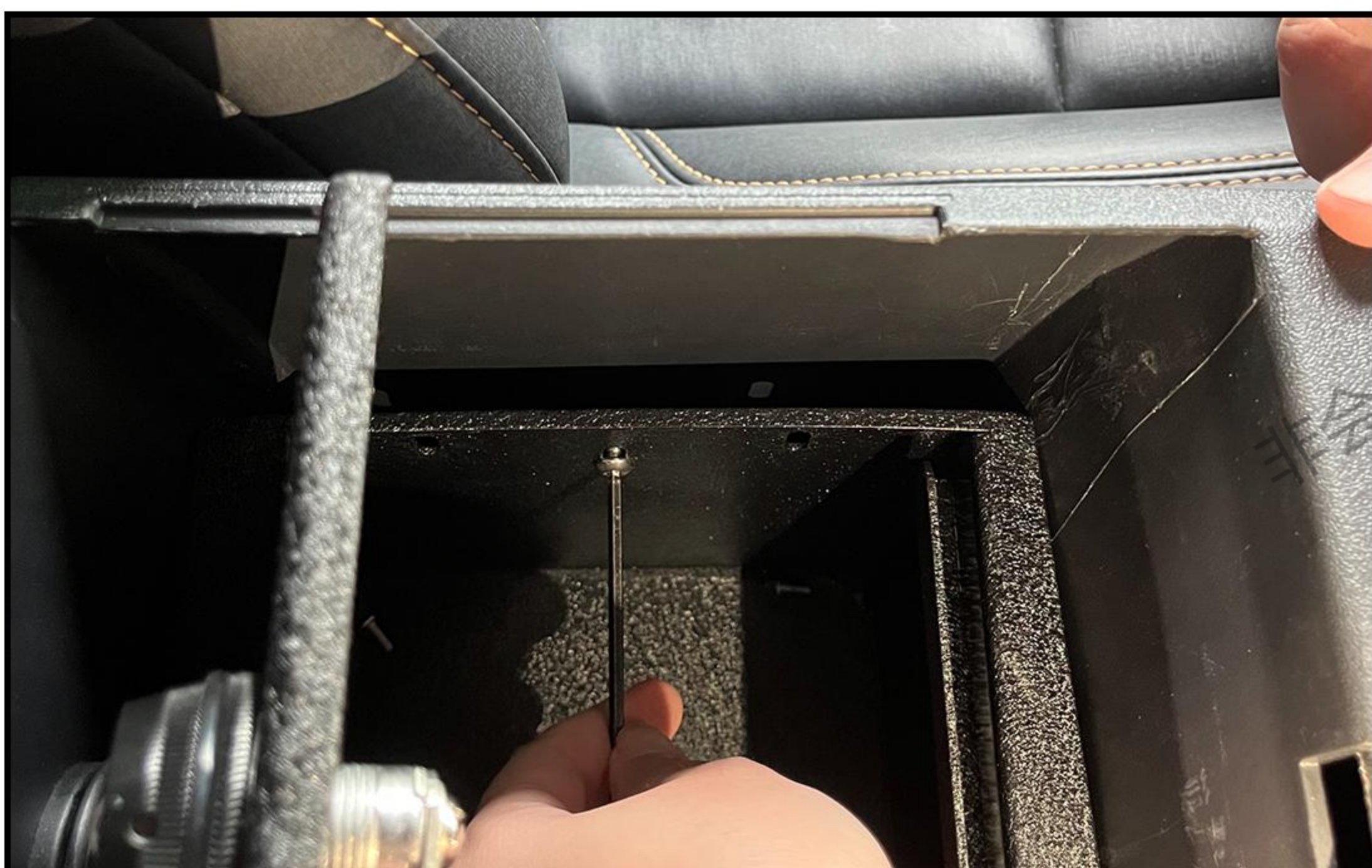
3. Tighten the middle screw