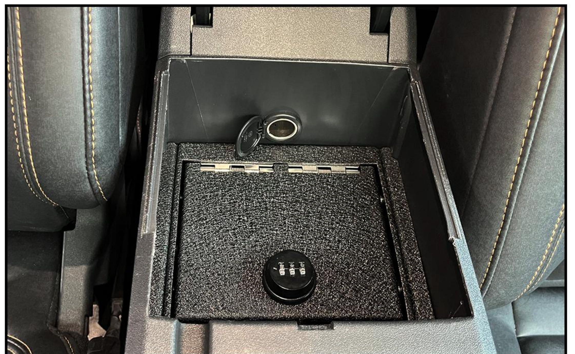
6. Installation completed