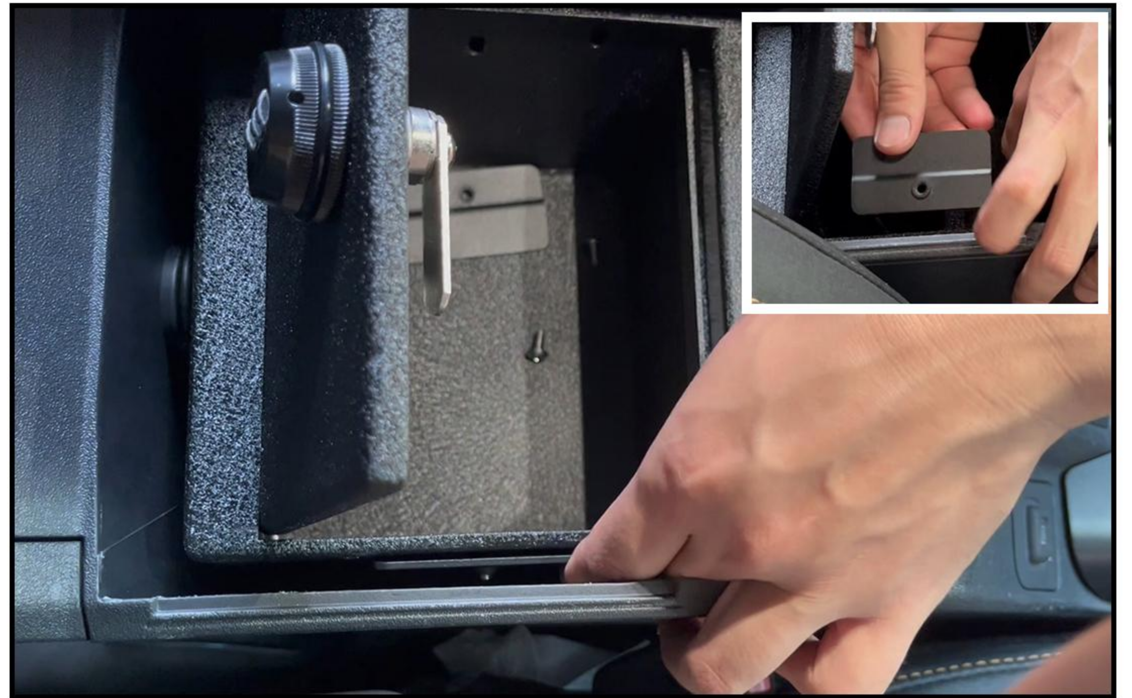
2. Put the short bracket to the position of the middle screw