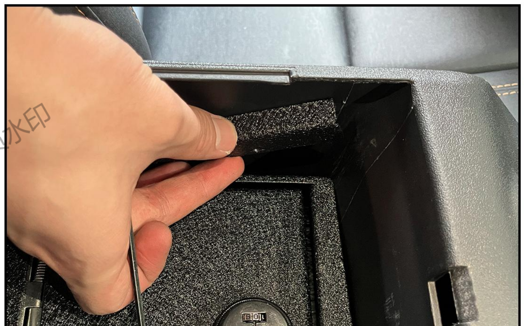
4. Put in the long bracket