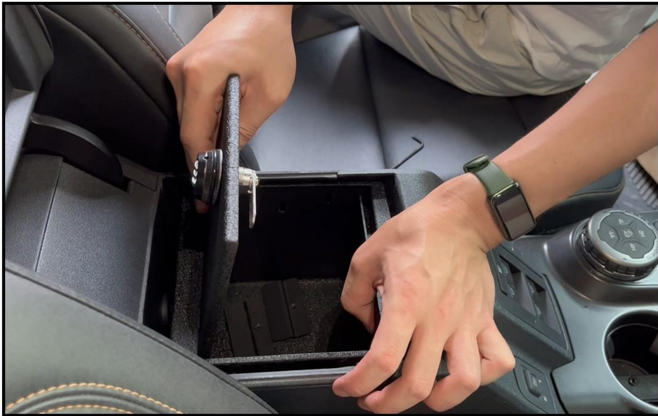
1. Put the Safe Lockbox into the Center Console