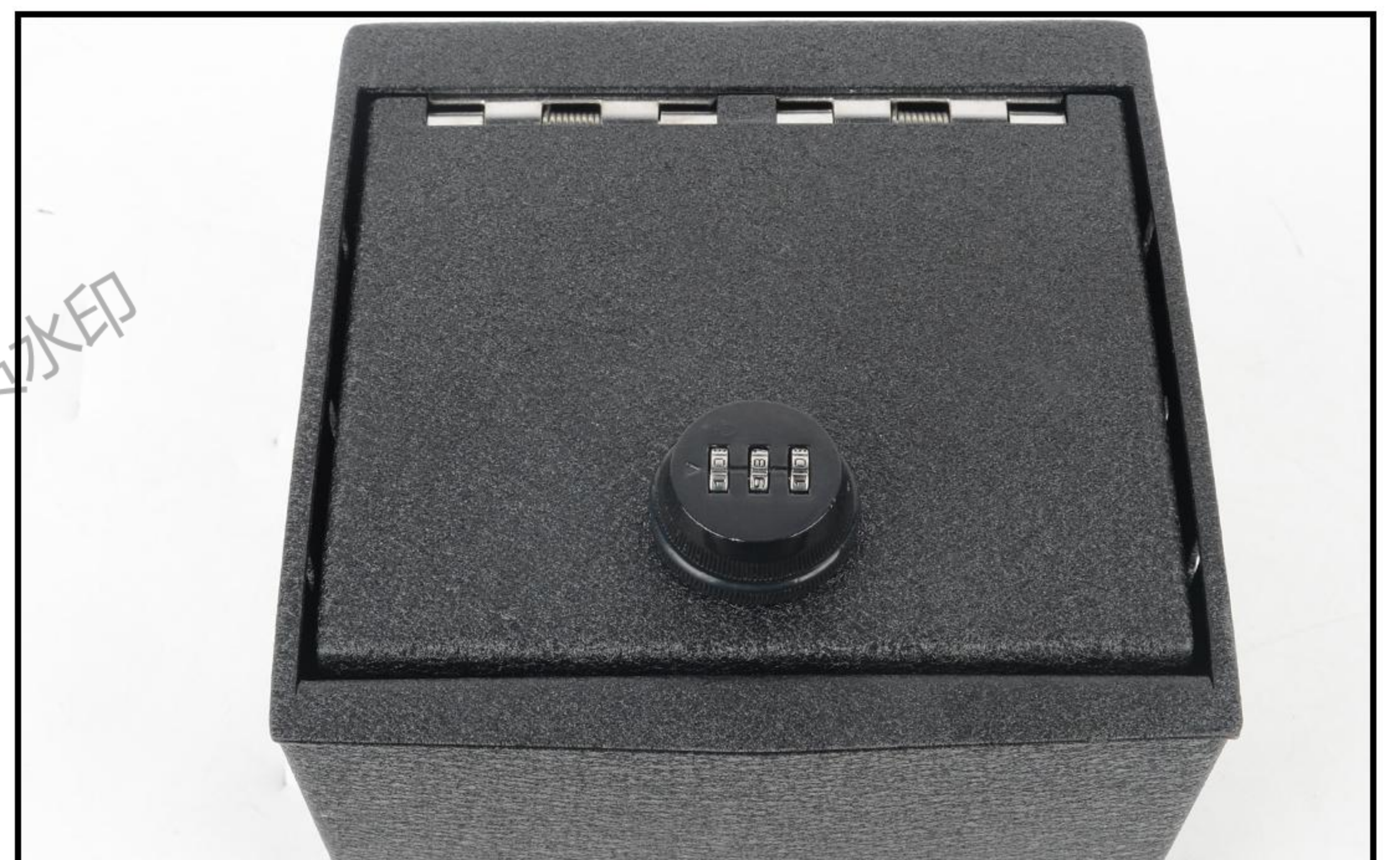
4. Complete setup