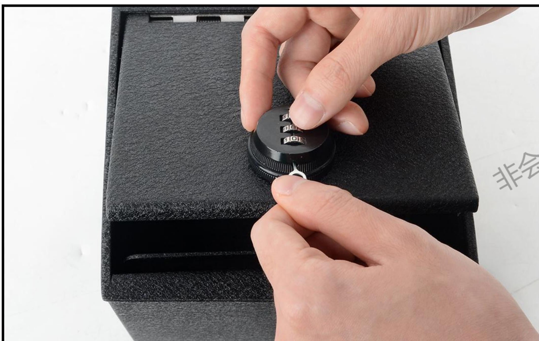
3. Insert the hole and change your own password at the same time