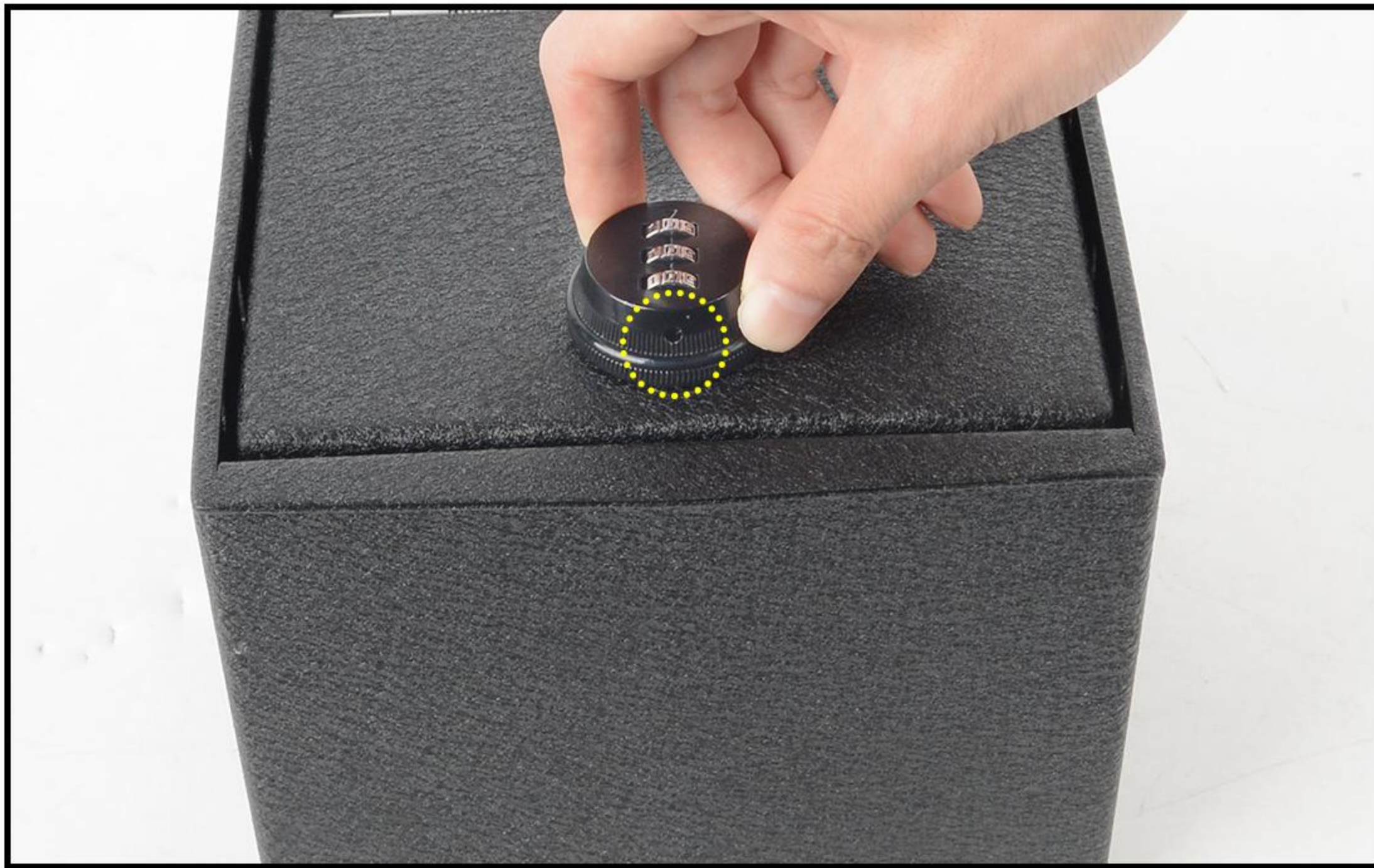
1. Turn lock to open (The default password is "000")