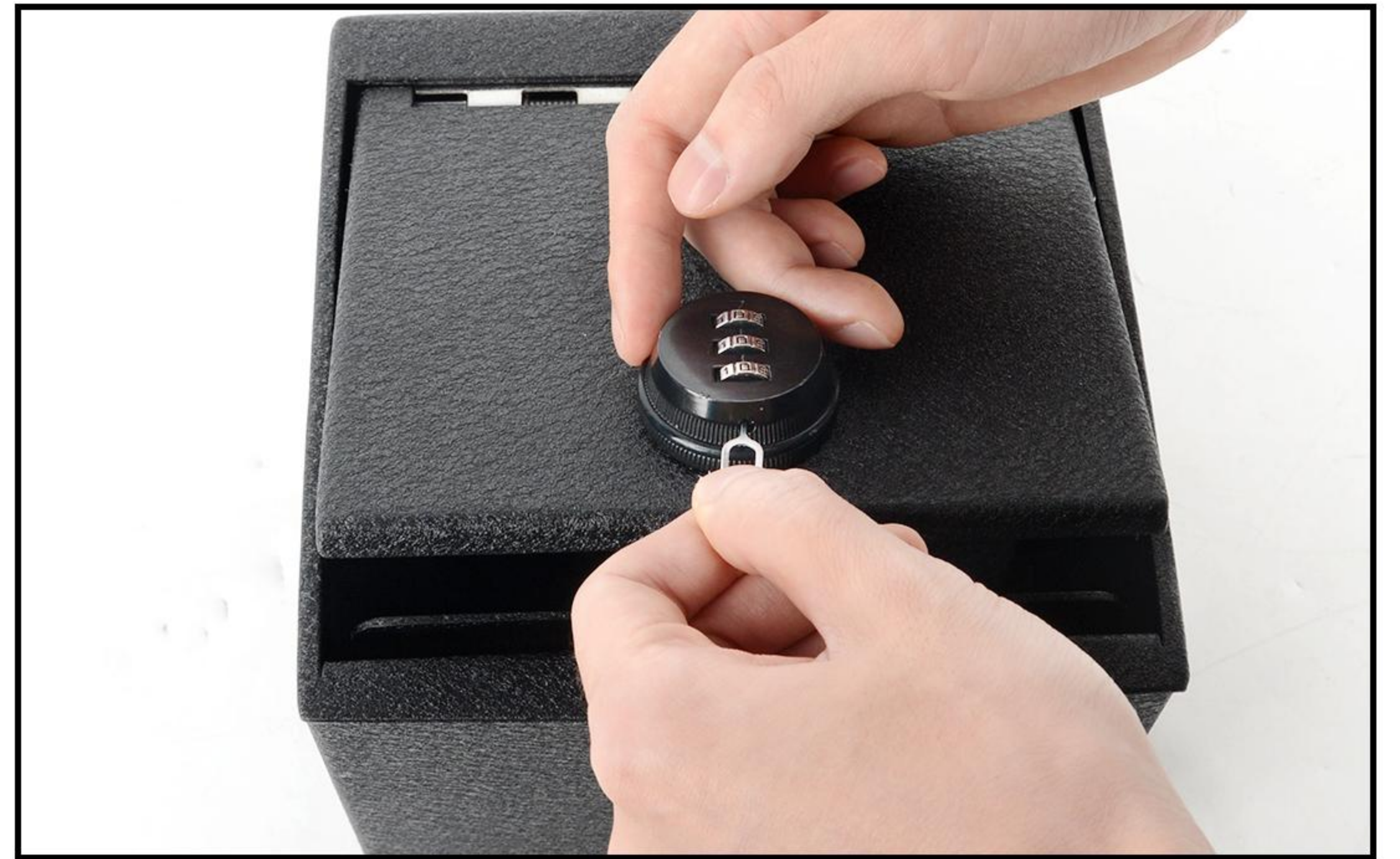
2. Insert a sharp tool into the hole